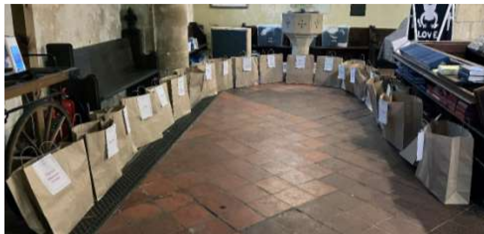
Donations for the Reverse Advent Calendar Froxfield and Privett Parish Information